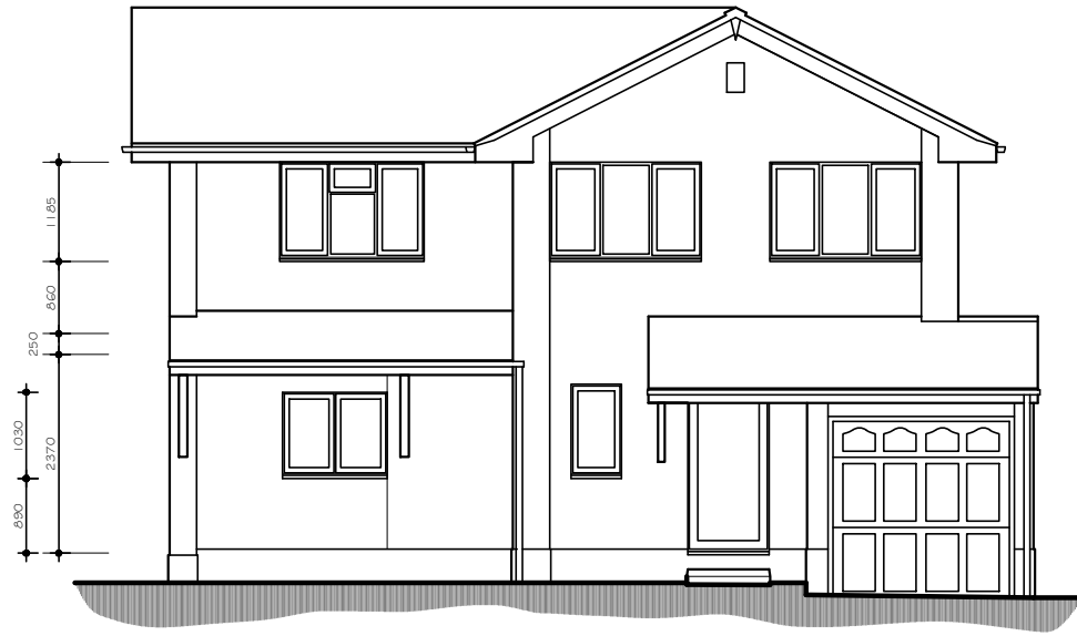
North / Front Elevation Scale 1:100