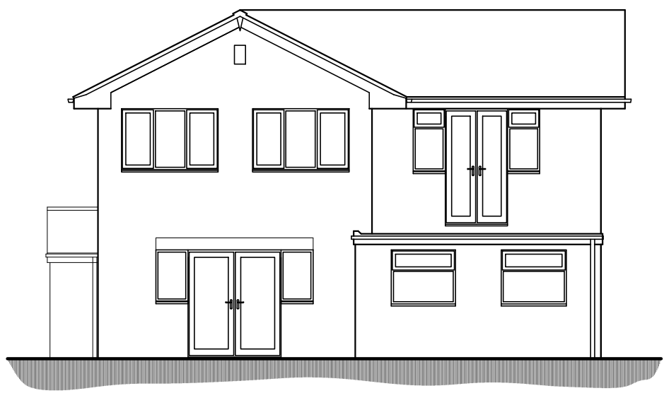
South / Rear Elevation Scale 1:100